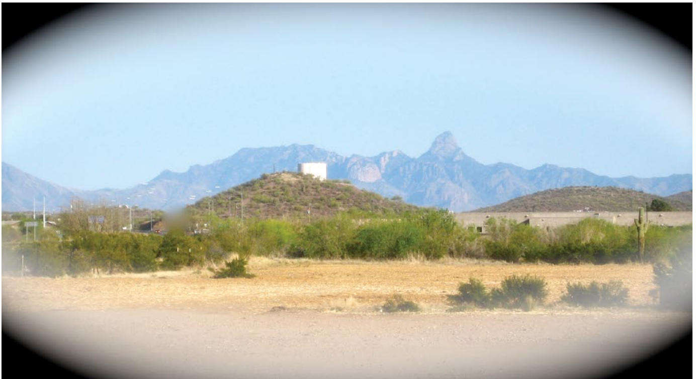
Photograph-Sells Water Tank

"Serving the Tohono O'odham Nation with electricity, telephone, water/wastewater service."